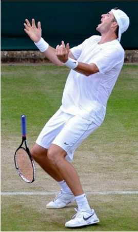
John in victory!

The world watched 23 rd seed John Isner ('03) as he won his first match at Wimbledon. This 2003 Page Alumnus defeated Nicolas Mahut in a multi-record-setting match.....longest in history at eleven hours and five minutes; most games won by a single player at Wimbledon at 92; most aces served by a single player at 113. The match was played June 22, 23, and 24.